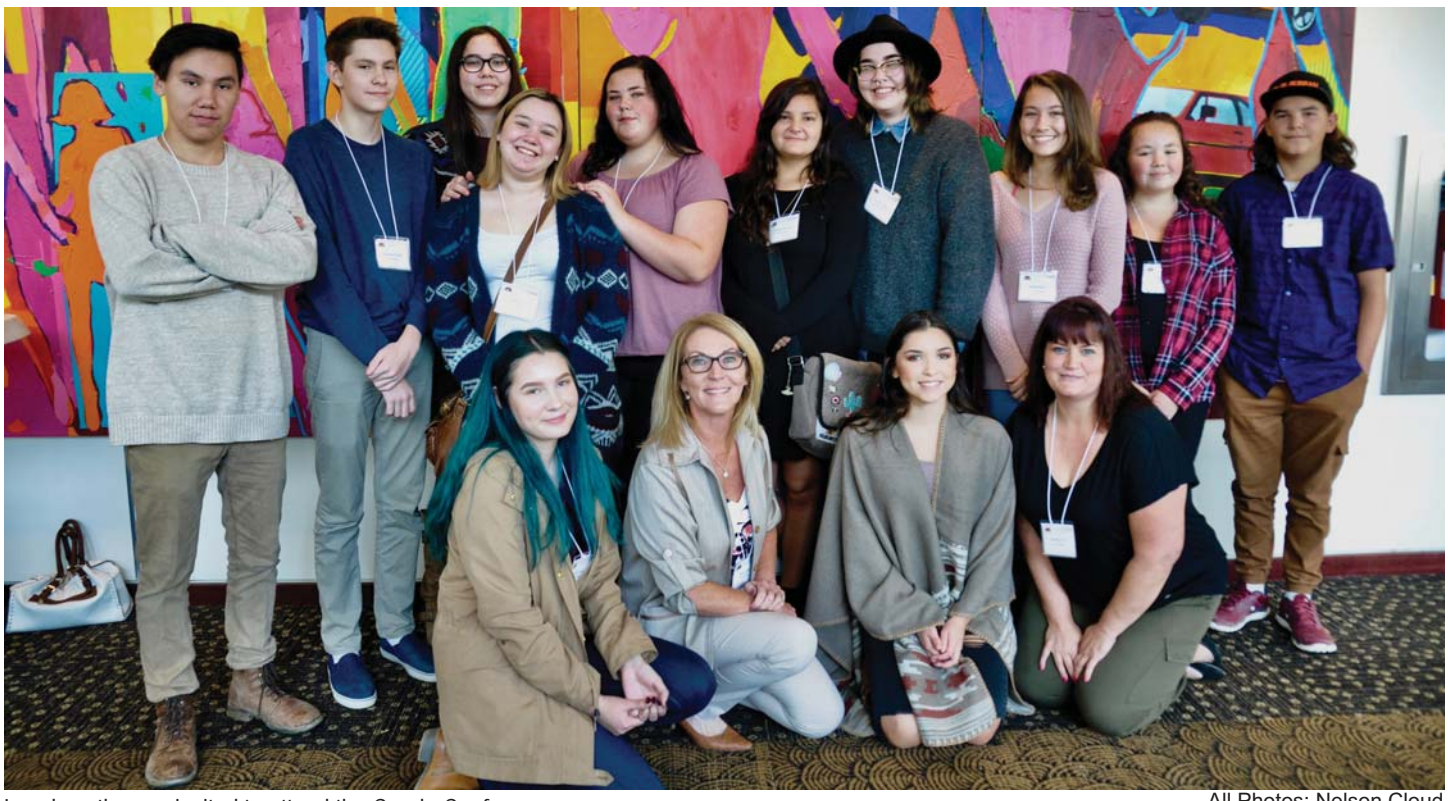
Local youth were invited to attend the Cando Conference.