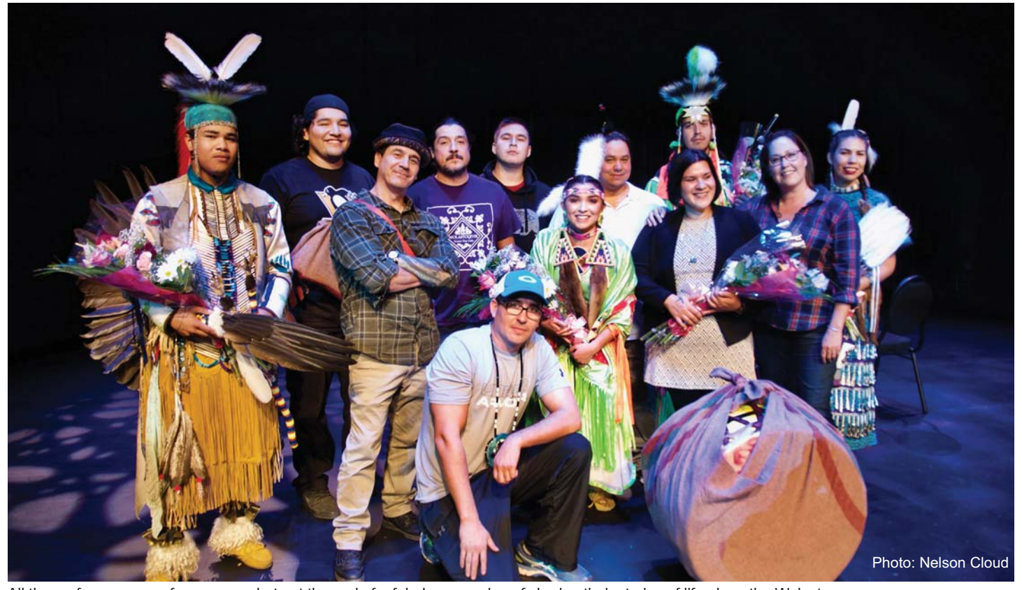
All the performers pose for a group photo at the end of a fabulous evening of sharing their stories of life along the Wolastoq.