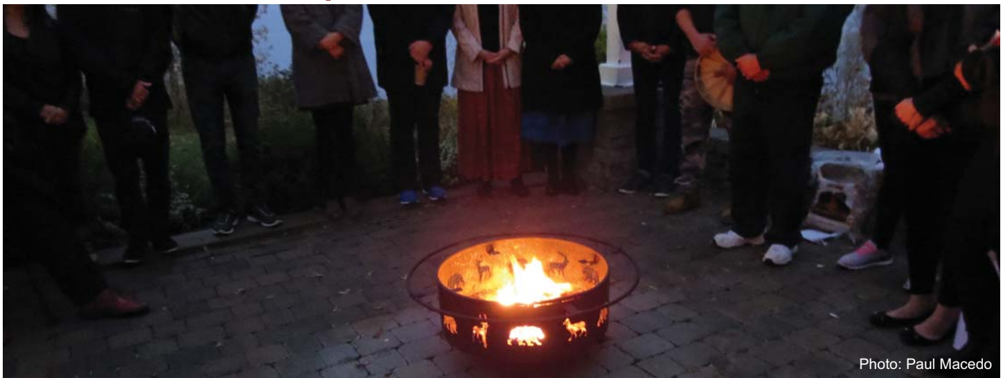
Many conference delegates braved the cool temperatures for a powerful sunrise ceremony held by Elder Imelda Perley along the shore of the Wolastog.