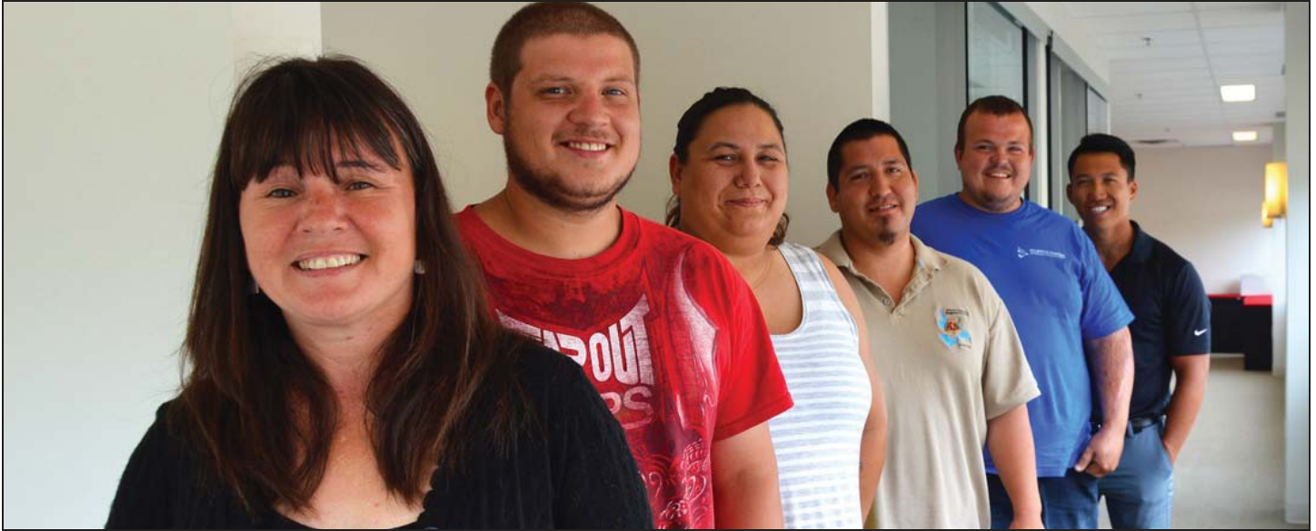
Projects include the New Brunswick Aboriginal Shipbuilding Engagement Strategy, the New Brunswick Aboriginal Information Communications Technology Project and the New Brunswick Aboriginal Mining, Energy, and Trades Project.