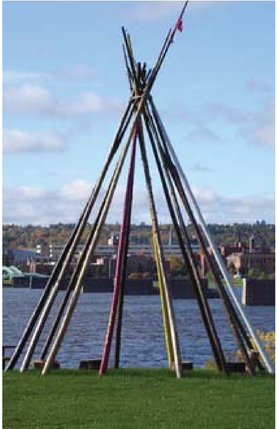
St. Mary’s First Nation old reserve grounds.

“We reinvest everything into our people because at the end of the day we want people to recycle (their money) back into the community,” he said.