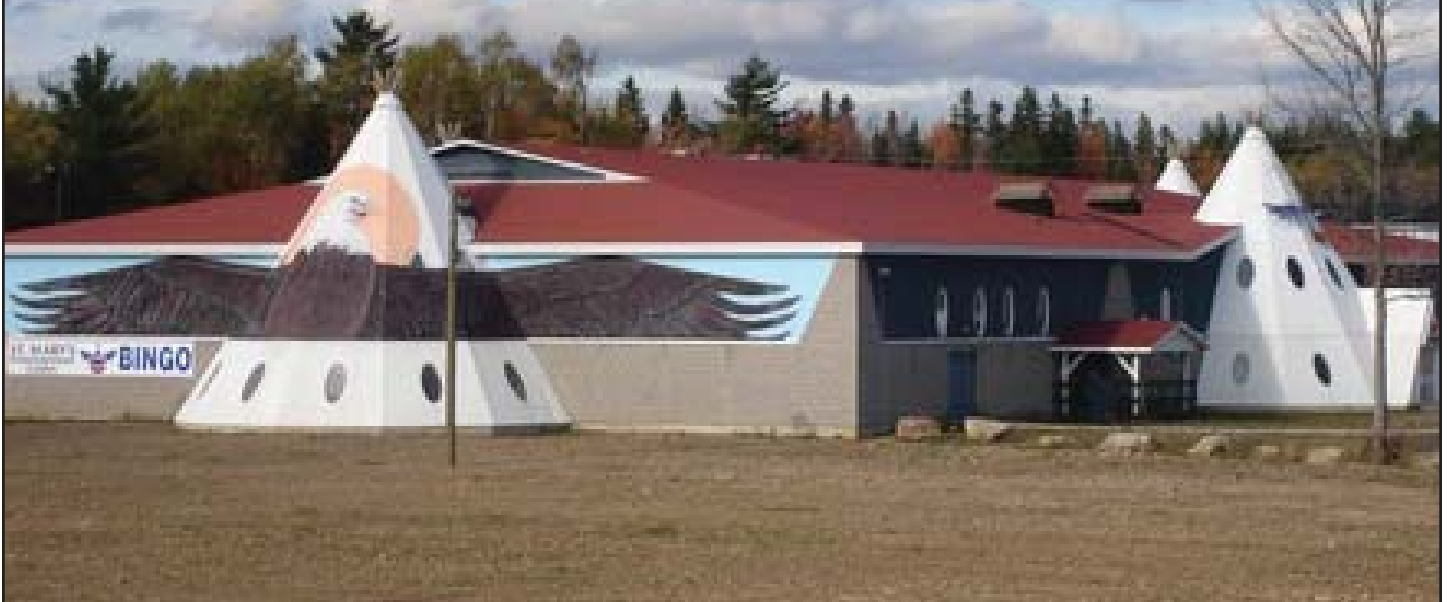
St. Mary's has the largest entertainment complex in Atlantic Canada.