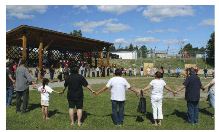
Round dance at Friendship Accord Signing in 2014.

Reflecting on the lessons learned from the CEDI project, Roy spoke of open communication and