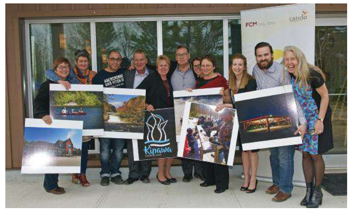
Mayors, Chief and Economic Development Officers celebrate the launch of their joint tourism products.

The First Nations–Municipal Community Economic Development Initiative (CEDI) is a joint project of the Federation of Canadian Municipalities (FCM) and Cando (the Council for the Advancement of Native Development Officers). From 2013 to 2016, the initiative worked with six community partnerships across Canada in urban, rural and remote settings. Hundreds of communities expressed interest in collaborating with this unique initiative and as a result, FCM and Cando are currently implementing a second phase of CEDI until 2021.